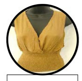
No Low-Cut Tops