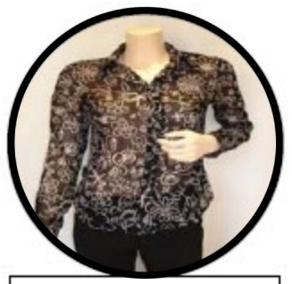
No See-Through Tops