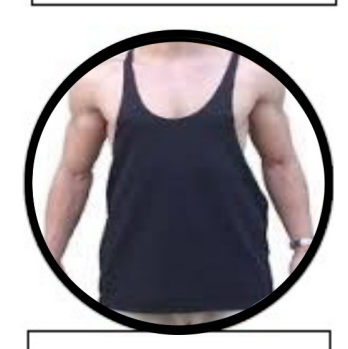
No Low Cut Tank Tops