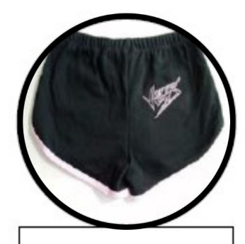
No Short Shorts or Short Skirts