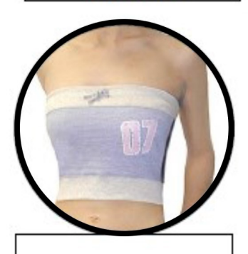
No Tube Tops